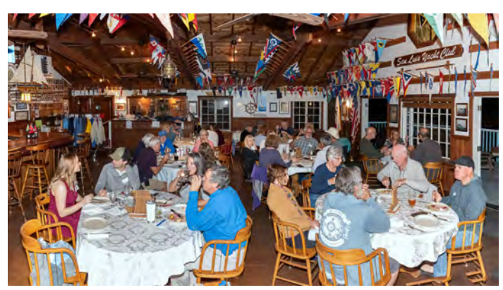
Members dining at the awards night event.