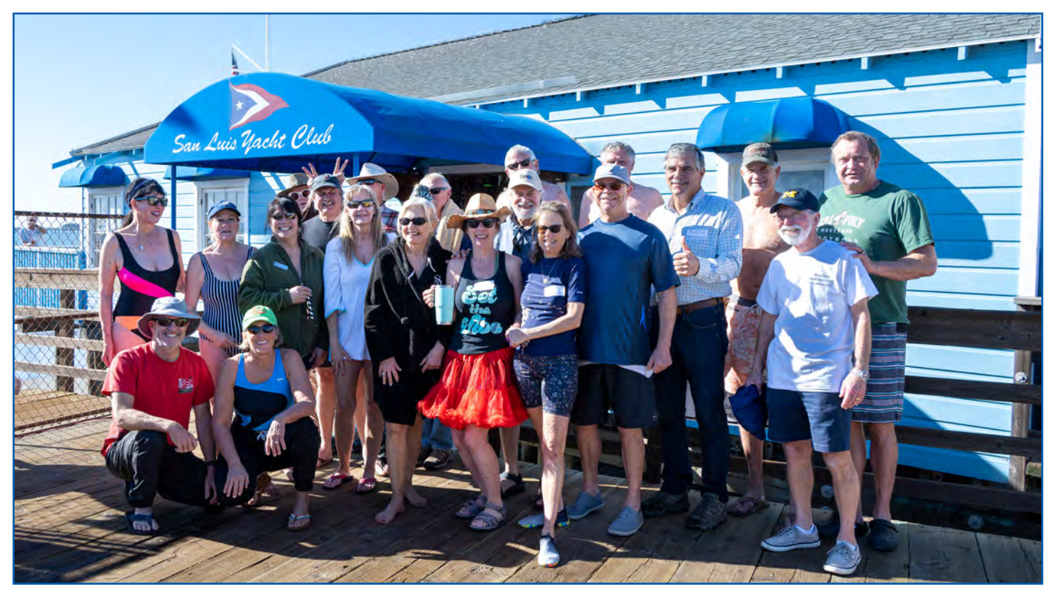
Polar Plunge participants (well, most of them)