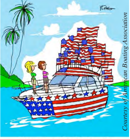
"As you can see, 4th of July is one of my husband's favorite times of the year."

July 4th Avila Boat Parade Noon-2pm followed by Cheeseburgers in Paradise at the club. See you there!