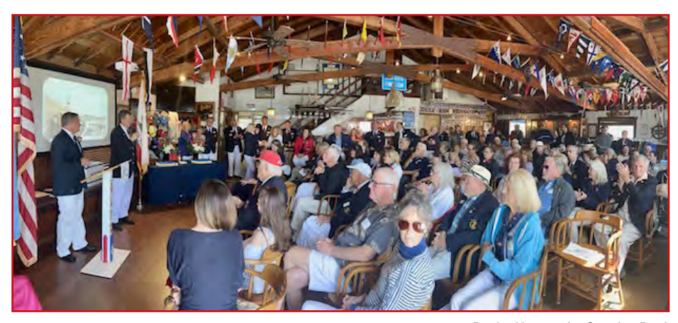
Packed house for Opening Day!

We were well-staffed for the events through May—Thank you to all of the members who have volunteered to date.