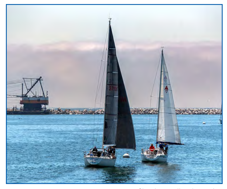
Closely rounding the mark...

ello Sailors. The Ocean racing season is going well. The 1st race we had 5 boats, but the wind was severely lacking, so it was a short race day. The 2nd Race we were blessed with more wind and got in several races. The season is challenging due to several rules which have come into play. "Allegra" and "Second Wind" have been very competitive. The winds in Port San Luis Bay are always changing. Some races start with limited wind inside yet past the break water it may be blowing 20 knots. As you can see in the photos, sometimes the boats are in irons and in the same race the boats are healing over and needing to reef in. The far outer mark C usually has the most wind and requires Skippers, to decide to Jibe around mark or chicken Jibe around mark. Jibing in strong winds requires great timing of the crew and Helmsman to avoid mishaps. A chicken jib is the safer route rounding up into wind coming about and falling off to round mark. This season we have some races with challenges. One race exceeded the two hour time limit, but the boats were with in a couple hundred yard of the finish line. Another race we had 2 boats racing for a mark. One boat called for room