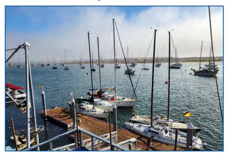
"Amilie" rafted at the MBYC dock

On Saturday, August 5, the Zongo Cup Race from Morro Bay to Port San Luis was held. There was a well-attended afterrace event at our Club to present the awards and hear stories.