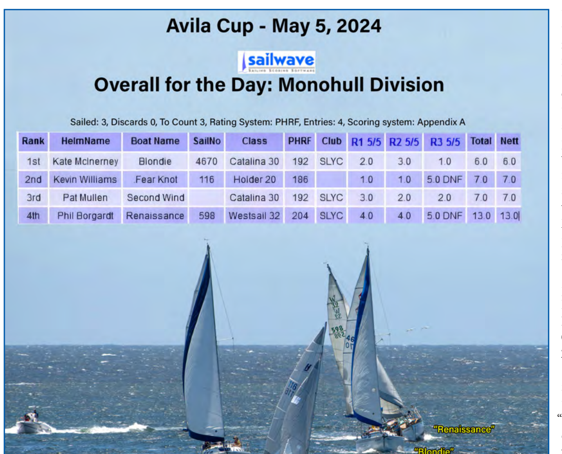
Racing fleet for Avila Cup May 2024. Chase boat on left.