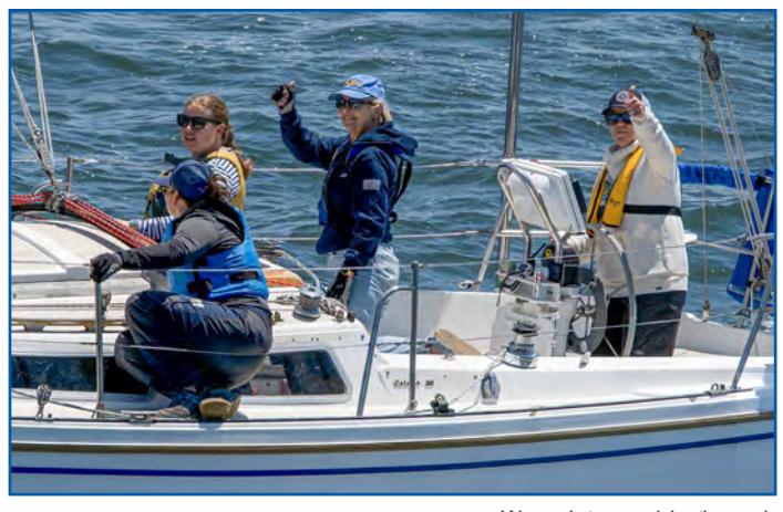
Women's team celebrating a win.

The first race we decided to send the sailors out to the far mark, and it was a great race. The wind continued to pick up, so the second race was a short race inside. The third race the wind really was blowing over 20 knots at times, we had two boats that had some trouble. The holder 20 broke its boom on a downward