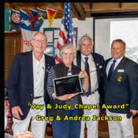
"Jay & Judy Chapel Award"