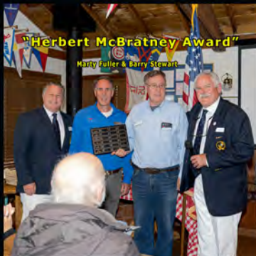
"Herbert McBratney Award"