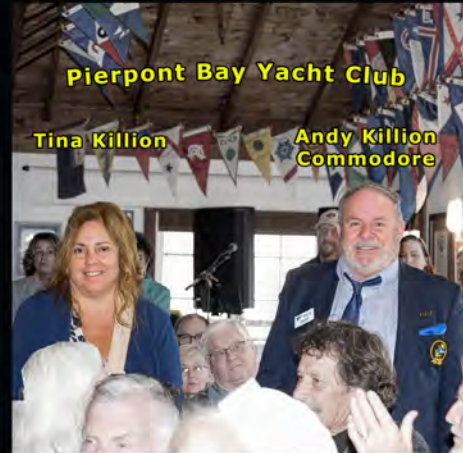
Pierpont Bay Yacht Club