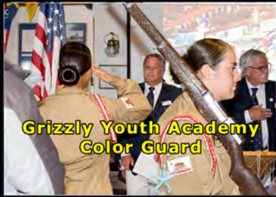
Grizzly Youth Academy Color Guard