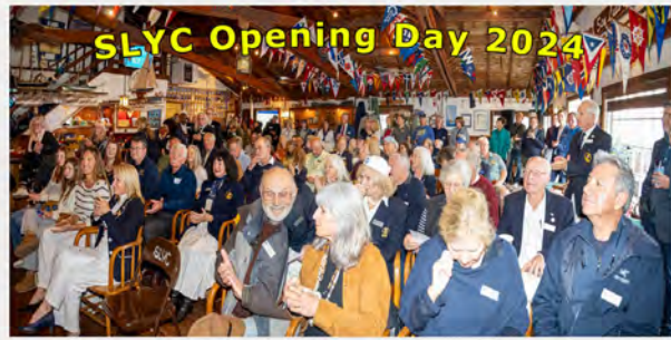
SLYC Opening Day 2024