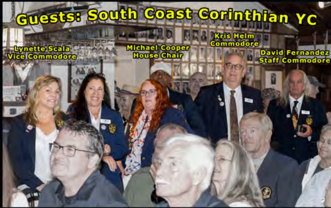
Guests: South Coast Corinthian YC