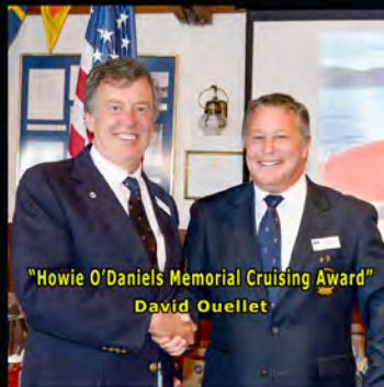
"Howie O'Daniels Memorial Cruising Award"