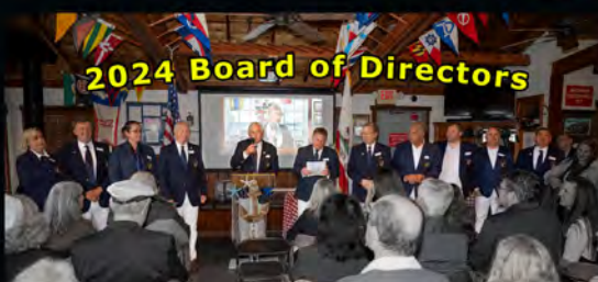
2024 Board of Directors