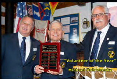
"Volunteer of the Year"